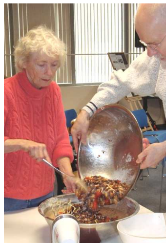
Adding dried fruit and nuts to the batter.

On Tuesday, October 25, a group of intrepid bakers converged on Don Heights to prepare fruitcakes for the Christmas Evening Service of December 18.