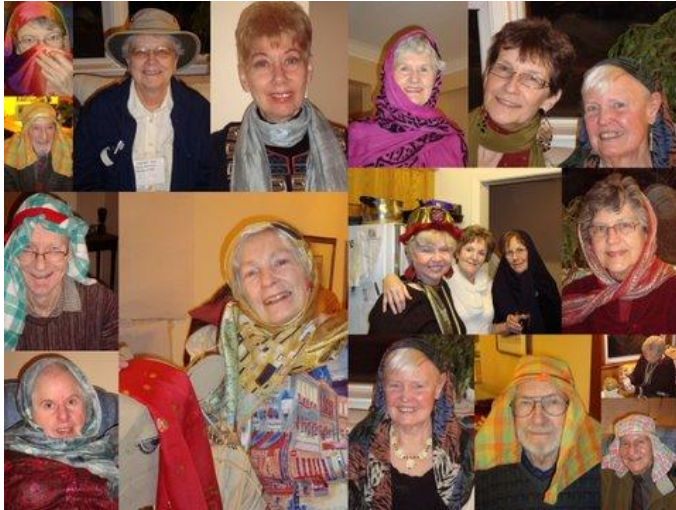
January 16, 2010

Camelot arrived at Don Heights to raise money for our Palestinian family.