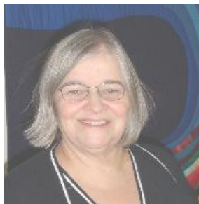
Don Heights, Dialogue and Democracy

Lately I've been thinking about power and responsibility in all aspects of life. Maybe proroguing has renewed my interest in how power is played out. I've been thinking about how vulnerable freedom and democracy are. Are they usually taken from us or do we give them away? This led me to thoughts on democratic power within a religious organization. So I began thinking about how democracy works at Don Heights.