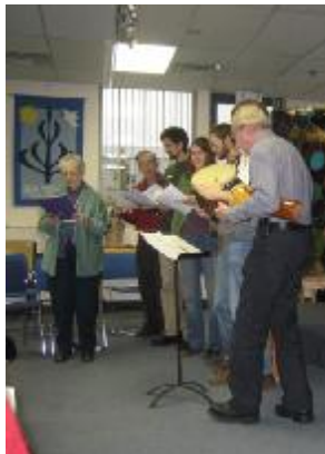
Don Heights Choir, January 17, 2001