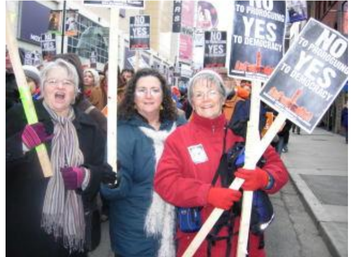
January 23, 2010

Camelot arrived at Don Heights to raise money for our Palestinian family.